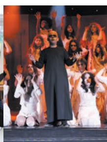
ON THE STAGE