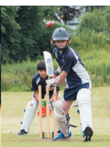
ON THE SPORTS FIELD