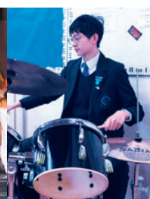
IN THE MUSIC ROOMS