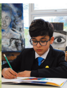
IN THE ART STUDIOS